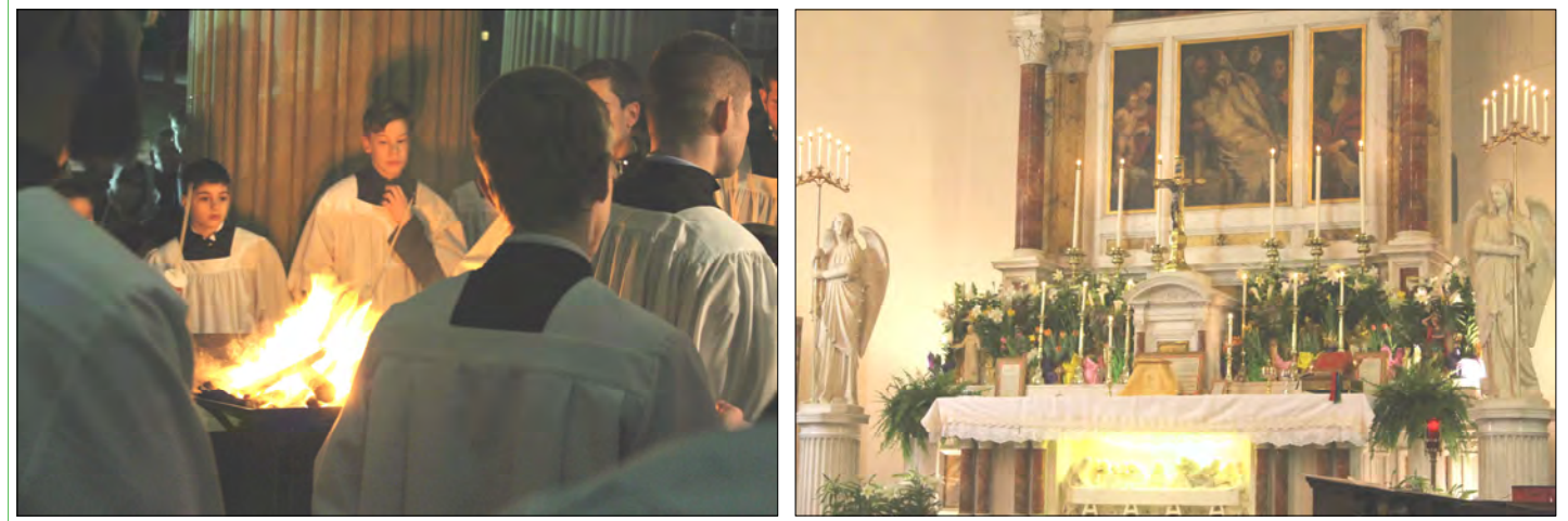
May 5th, A.D. 2019