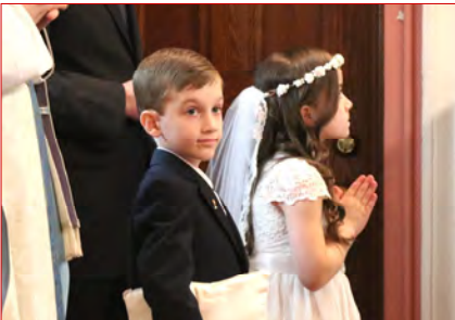
June 9th, A.D. 2019