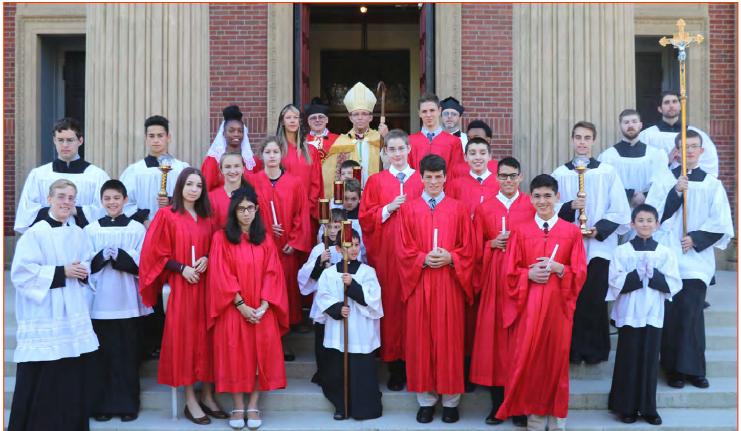
September 29th, A.D. 2019 Michaelmas/16th Sunday after Pentecost/26th Sunday of the Year Mary Immaculate of Lourdes, Newton/Needham, Massachusetts