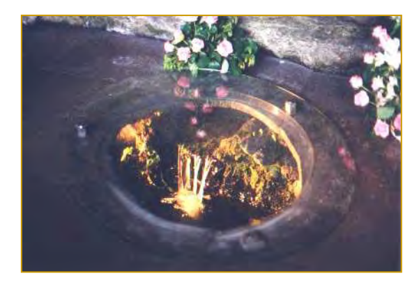
PHOTO above: the Lourdes spring as it comes out of the Massabielle. This is how pilgrims to the Shrine today can view it.

Please join us for this year's Lenten Parish Mission over six Fridays of Lent beginning on Friday after Ash, February 28th. The service consists of the VIA CRUCIS (Stations of the Cross), followed by a Sermon, distribution of Holy Communion outside of Mass, and concludes with Exposition and Benediction of the Blessed Sacrament. This year's theme is: "THE FIRST FIFTY YEARS OF THE LOURDES PILGRIMAGE". The six Conferences will present various aspects of the coming-to-be of the now world-famous Lourdes Pilgrimage in the decades immediately following France's disastrous defeat in the Franco-Prussian War (1870-1871).