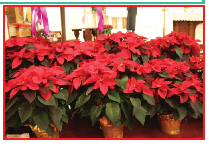
FRONT COVER: Christmas poinsettias banked around the Advent wreath before the Mass of Christmas Eve, A.D. 2013.

The contrast between the lightsome mysteries of the Christmas celebration and the Present Trial, with its intensifying contagion, is stark indeed. We have to make conscientious effort not to let the things of eternity be displaced by passing tribulation. (For example, not reducing the Advent theme of Christ's coming to a metaphor for the arrival of a vaccine.)