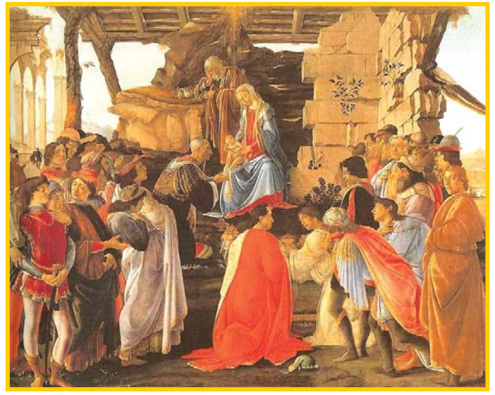
FRONT COVER: Adoration of the Magi, by Sandro Botticelli, A.D. 1475