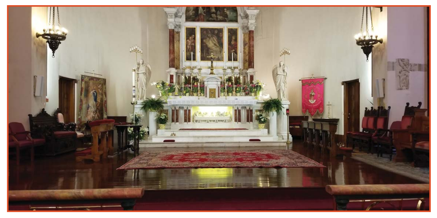
FRONT COVER: The sanctuary of Mary Immaculate of Lourdes, Easter Week, 2021 A.D.