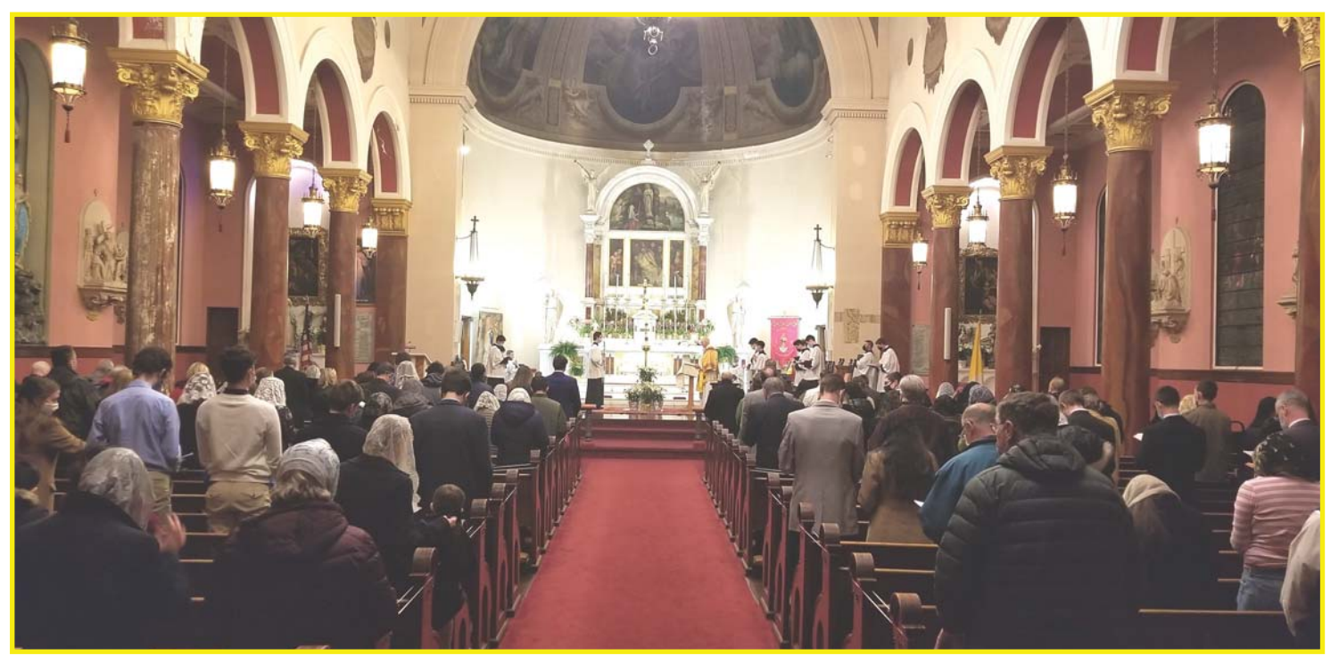
FRONT COVER: Another picture of this year's Easter Vigil.