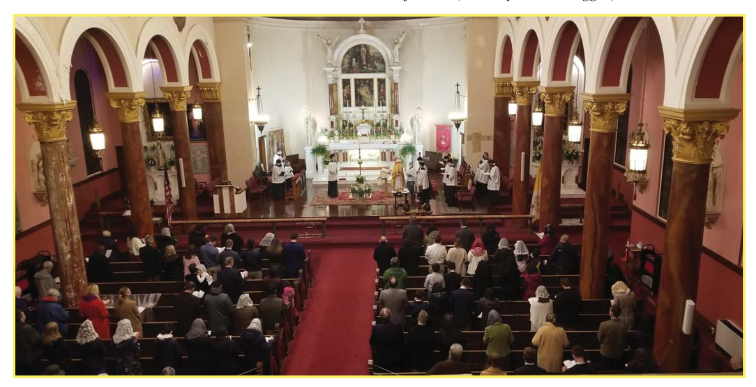
PHOTO (below): The "Exsultet", the Hymn of Praise of the Paschal Candle at the Easter Vigil, Easter Eve, April 3rd, 2021: "Let the Angelic Powers of Heave now rejoice..."