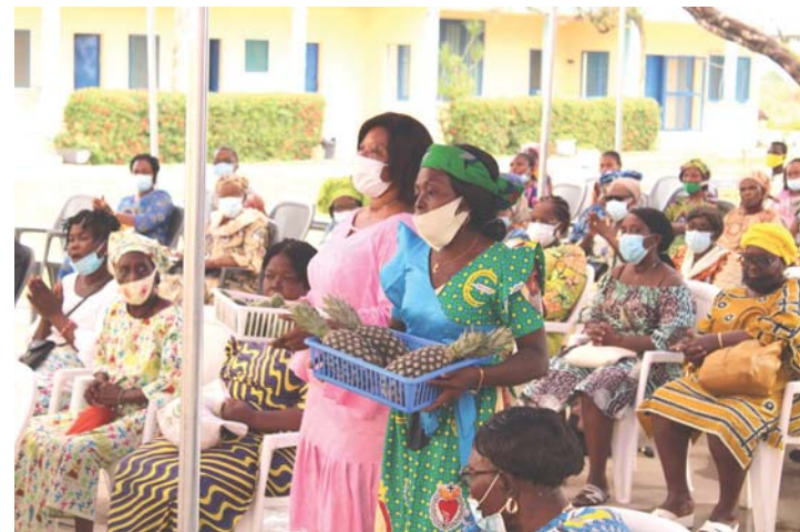
May 9th, A.D. 2021