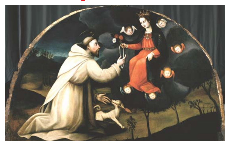
St. Dominic (+1221 A.D.)

FEAST DAY: August 4th (Old Calendar) August 8th (New Calendar)