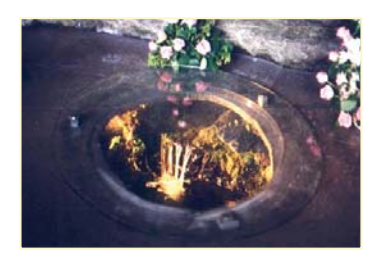
PHOTO above: the Lourdes spring as it comes out of the Massabielle. This is how pilgrims to the Shrine today can view it.