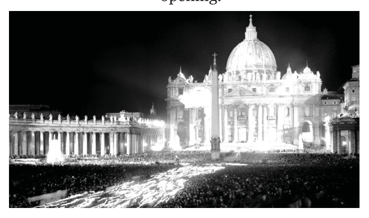
PHOTO above: On the night of the opening of Vatican II on October 11th, 1962 the young people of Catholic Action held a torchlight parade in St. Peter's Square. As they formed the shape of a Cross with their torches Pope John XXIII unexpectedly opened his window and made an informal address to the crowds below.

connection between Mary's intercessory role and the anticipated work of the Council. We see this manifested also in Pope John's pilgrimage to the Holy House of Loreto just before the Council's opening.