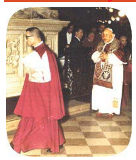
PHOTO left: Pope St. John XXIII visits the Holy House of Loreto shrine on October 4th, 1962 to pray for the success of the Second Vatican Council. Pope Benedict XVI repeated this pilgrimage in 2012 to mark the 50th Anniversary of the Council's opening.