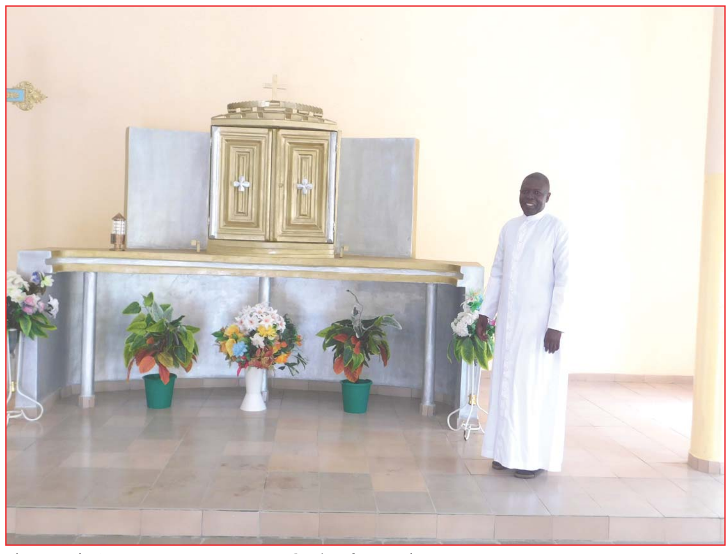
January 9th, A.D. 2022

Here in Benin, the pandemic is still very much present. Not even ten per cent of the populace is able to get COVID-19 vaccines because the solidarity between us (rich countries and poor countries) is not working as it should be and our government cannot provide them for