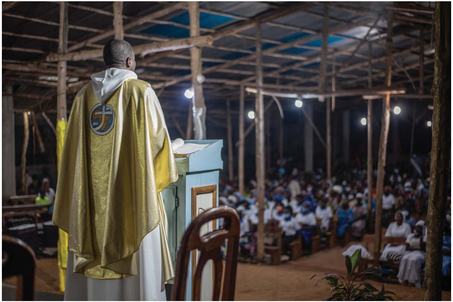
January 9th, A.D. 2022