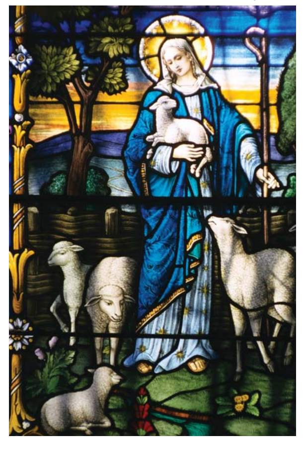
May 8th, A.D. 2022

FRONT COVER: Stained glass window of "Mary, Mother of the Good Shepherd".