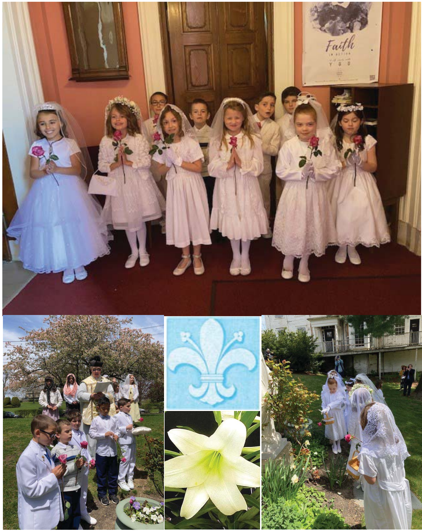
May 15th, A.D. 2022