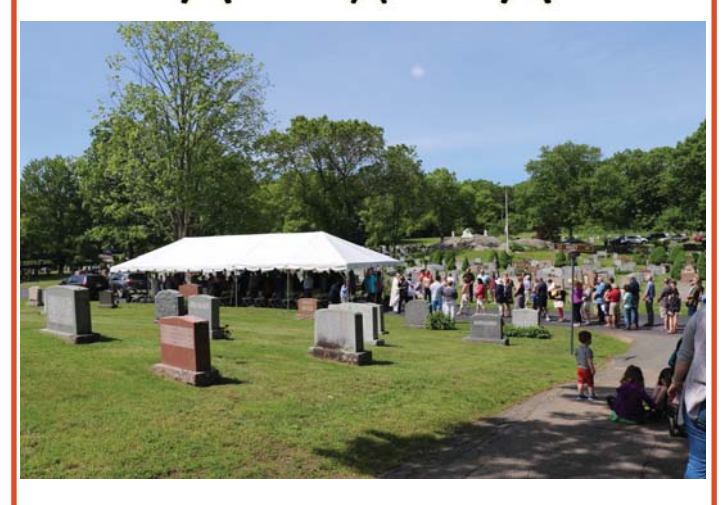
Refreshments will be served after Mass.