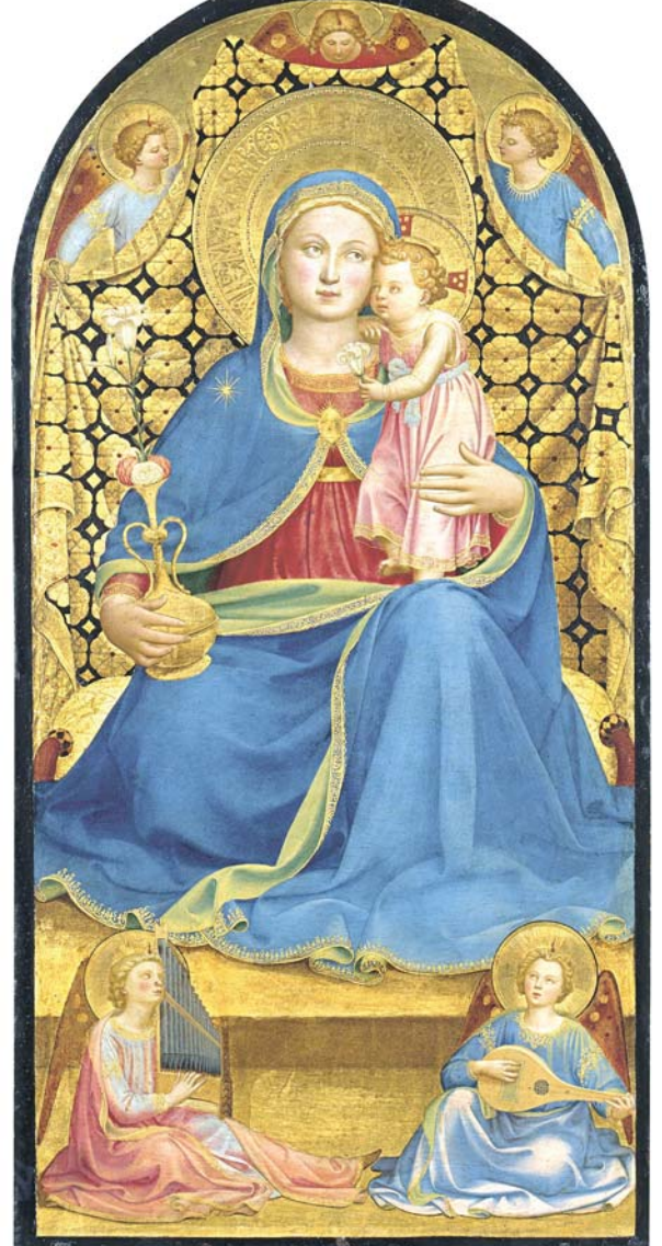
Christmas, A.D. 2022