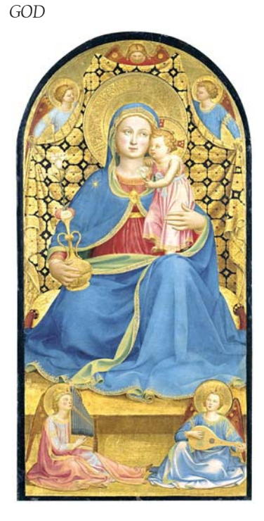
The Madonna of Humility