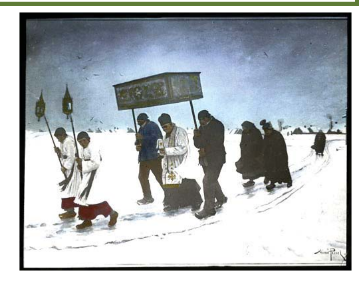
Procession of bringing Viaticum, the Communion for the dying, in French Canada (1800s).

respects over the days of mourning. It was a spectacle of mass-mourning such as Canada had never seen, and it reached across the border into the United States, particularly the New England states. So something quite mysterious was going on in the life of this man, which surfaced so dramatically upon his death. I suggest to you that in Frere André we see an example of the fulfillment of these verses from First Corinthians, about how God chooses what is foolish, weak, base and contemptible in the eyes of the world in order to overturn all worldly expectations, and thereby show forth His divine power precisely from where it was least expected to come.