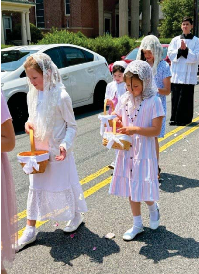
Parísh Corpus Chrístí Processíon: Sunday, June 11th, 2023