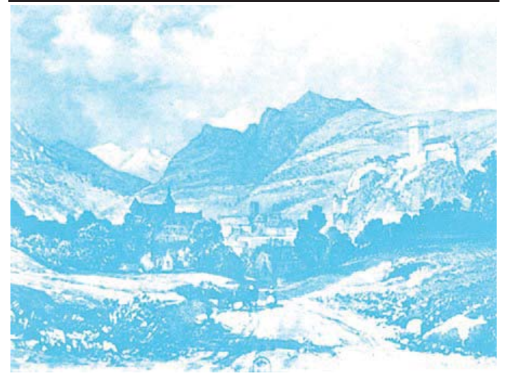
A sketch of the town of Lourdes as it appeared in 1858, the Year of the Apparitions