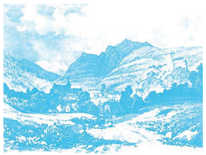
Sketch of the town of Lourdes as it was in 1858, the year of the Apparitions.